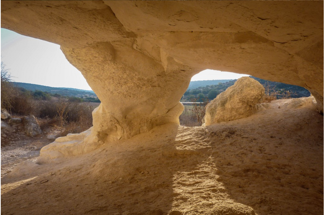
Terrain pictures